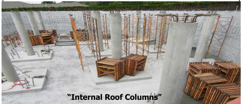
"Internal Roof Columns"

Even before the snow had melted, crews were on site getting prepared to start construction once again. The floor, walls, and column supports for the roof have all been poured. Crews are now currently building the structure to support the forms to pour the roof. We expect the roof to be poured later in June. After additional finish work to be done on the walls and other site work to be completed. Project is estimated to be complete in August!